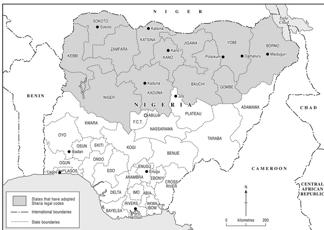
Figure 1 Sharia in Nigeria